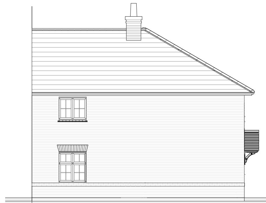
Rear Elevation— End