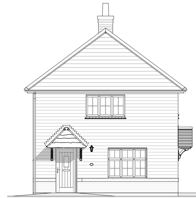
Side Elevation— End