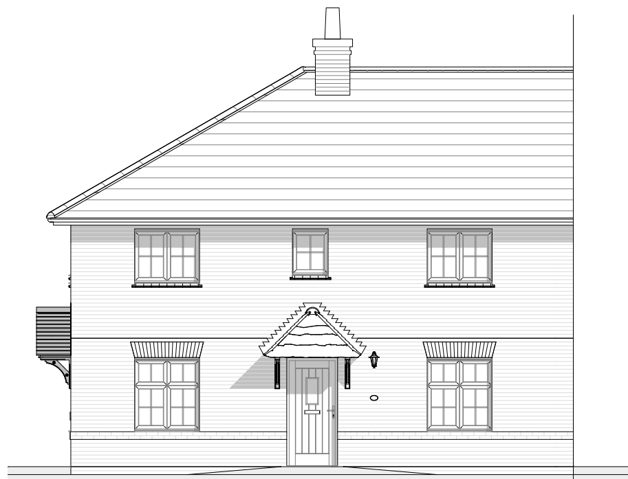
Front Elevation— End