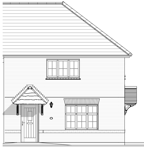
Front Elevation— End