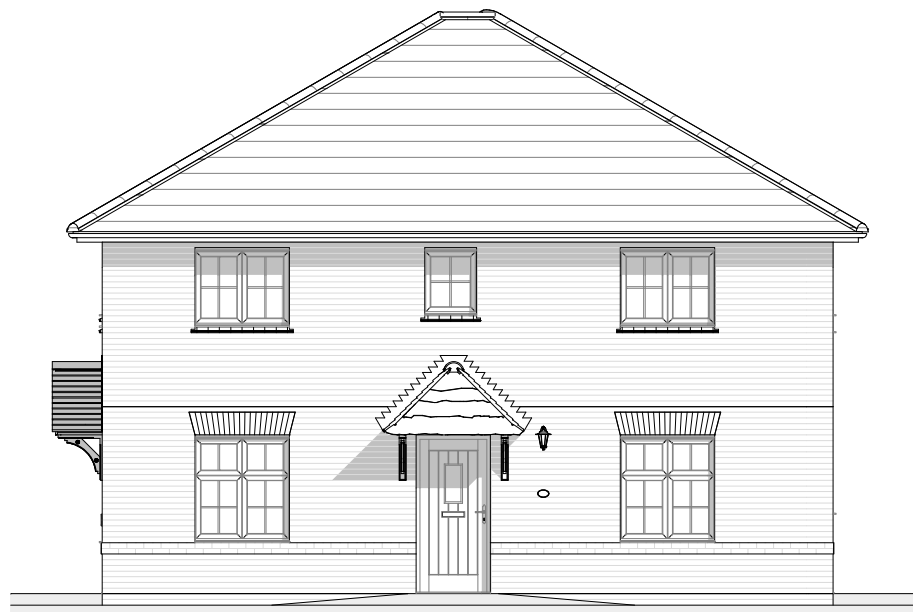
Side Elevation— End