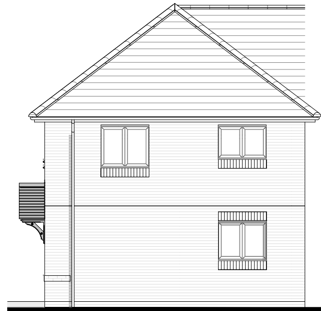
Rear Elevation— End